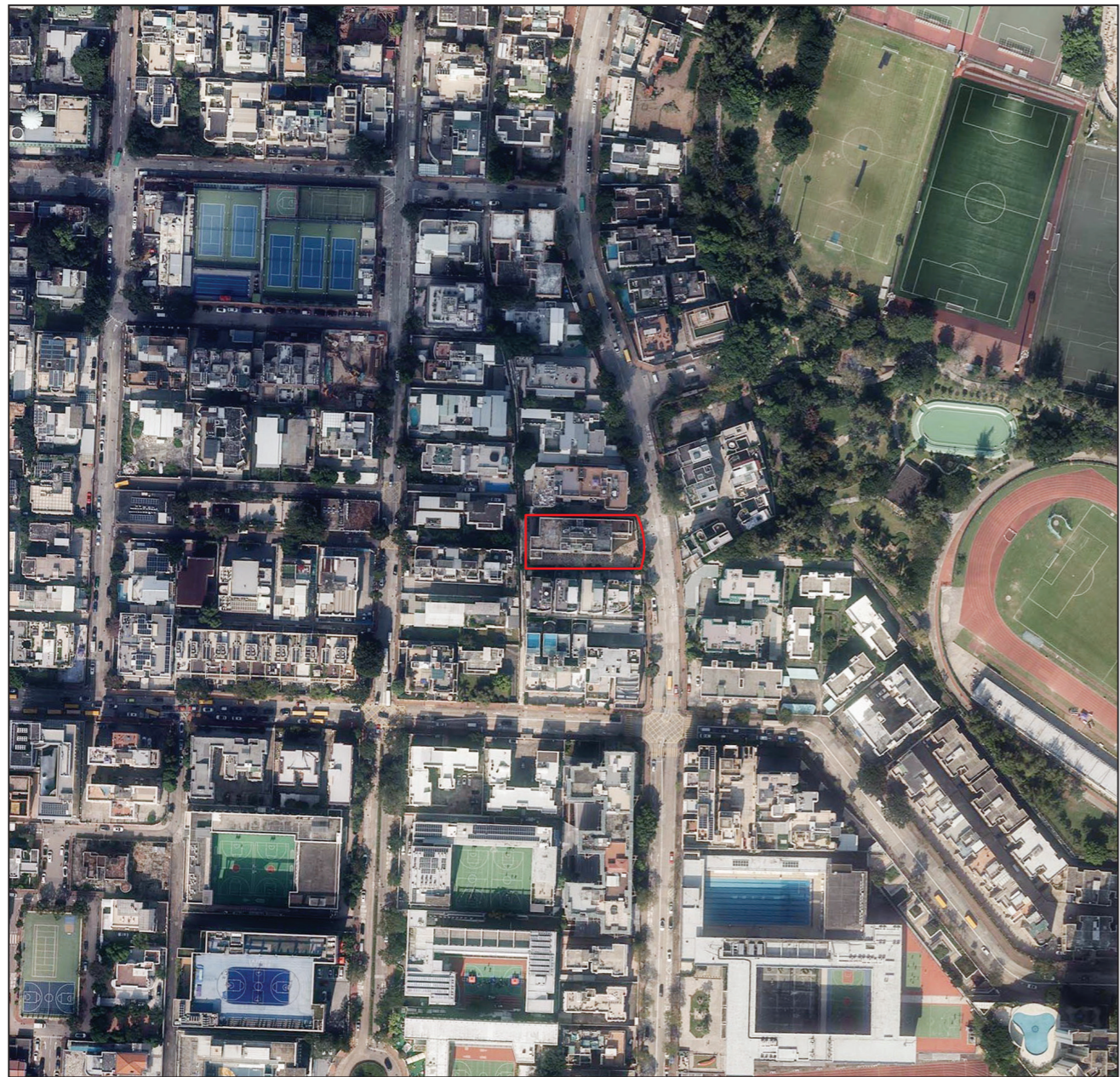
Location of the development 發展項目所在位置